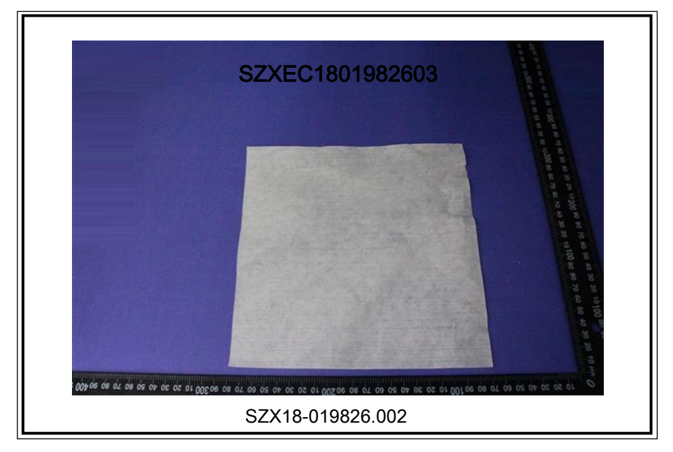
SGS authenticate the photo on original report only